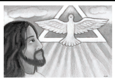
The Most Holy Trinity ~ 31 May 2015

Then Jesus approached and said to them, "All power in heaven and on earth has been given to me. Go, therefore, and make disciples of all nations, baptizing them in the name of the Father, and of the Son, and of the Holy Spirit." — MI 28:18:19